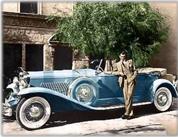
1931 Duesenberg Model J Derham Tourer with Gary Cooper