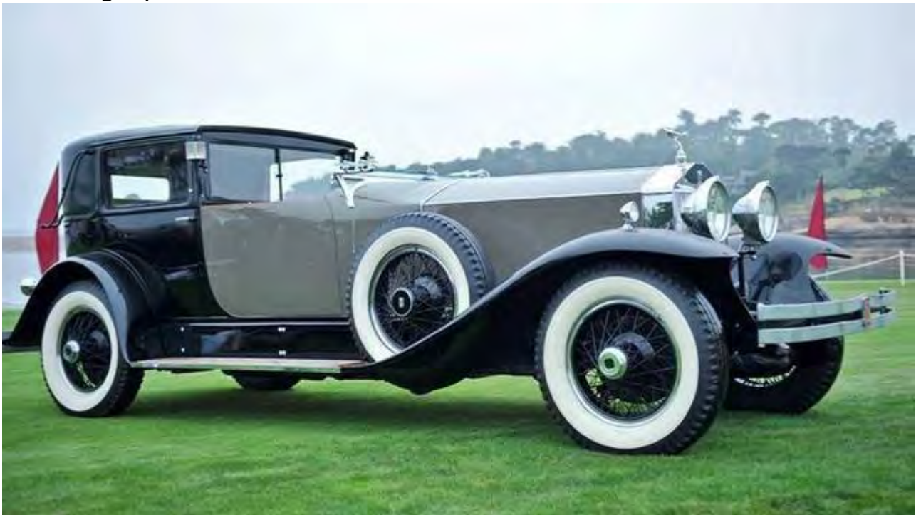
Rolls Royce Phantom I 1928

It was donated to a Springfield museum after his death. It has 1,070,000 miles on it and still runs like a Swiss watch, dead silent at any speed and is in perfect cosmetic condition.