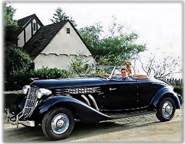
1935 Auburn Cabriolet Supercharger - With Errol Flynn and his dog