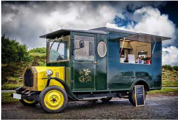
Time for a snack.....