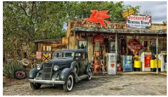
Maybe a stop for petrol