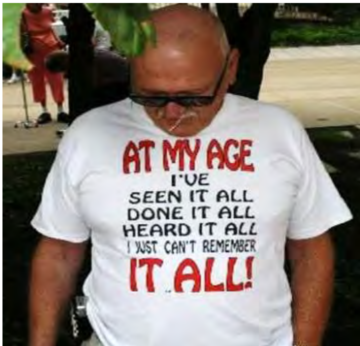
Who says senior citizens don't wear stylish clothes