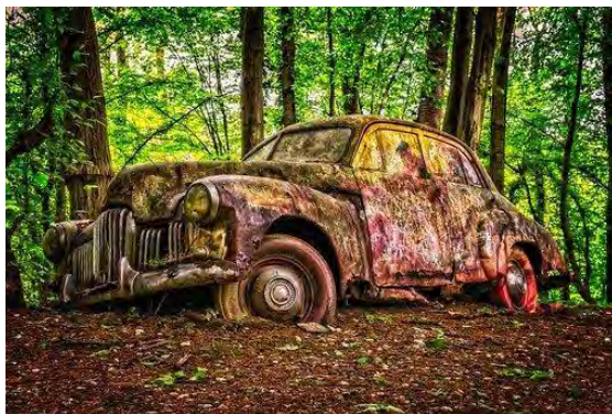
Looks like a few of us have got lost.....