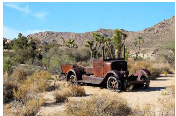
.....not listening to Riaan's instructions again