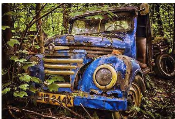
Don't worry we will find you one day....