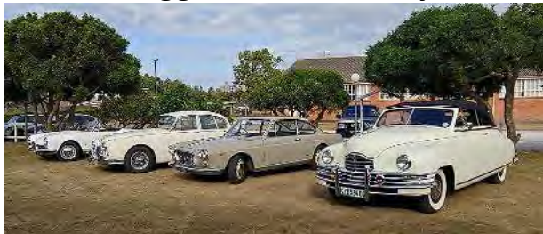
Noggin – 20 th February