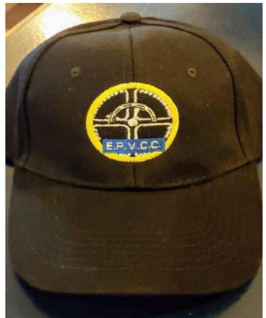
EPVCC Caps are available on Friday night at the bar from Devlin.