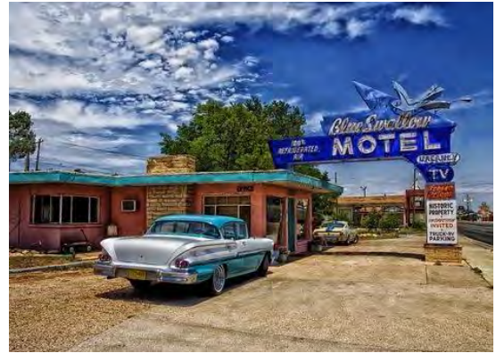
.....or a nap