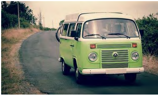
Nothing like the open road in a bus